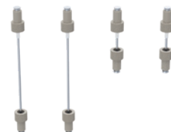
Capillary Set Ident. No. 0020103091