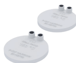
DR.PVDF narrow Disc reactor set, polyvinylidene difluoride, narrow, 2 pcs. Ident. No. 0020102706