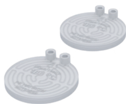
DR.PP narrow Disc reactor set, polypropylene, narrow, 2 pcs. Ident. No. 0020102705