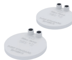
DR.PVDF standard Disc reactor set, polyvinylidene difluoride, standard, 2 pcs. Ident. No. 0020102638