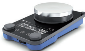
IKA Plate (RCT digital) Magnetic stirrer with heating Ident. No. 0025004601

If required, the following IKA devices are available for your lab to enhance flow chemistry with IKA FLOW System: