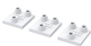
MX.PVDF Mixing chip set, polyvinylidene difluoride Ident. No. 0020103093