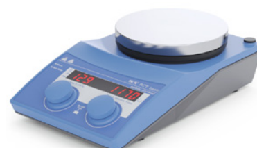
RCT basic Magnetic stirrer with heating Ident. No. 0003810000