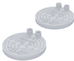
DR.PP standard Disc reactor set, polypropylene, standard, 2 pcs. Ident. No. 0020102637