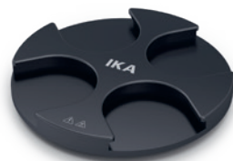
Heating Block Heating block for up to four disc reactors Ident. No. 0020103369