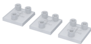
MX.PP Mixing chip set, polypropylene Ident. No. 0020103092